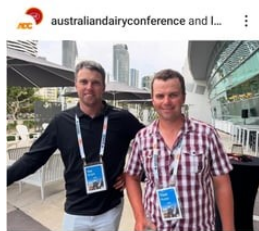
australiandairyconference and I... australiandairyconference ADC... more

From the Young Farmers Networking Function to the Welcome Function, the energy was high as delegates engaged in thought-provoking discussions. The conference sessions covered critical themes, including sustainability, market growth, industry resilience, and technological advancements.