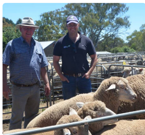
Mt Pleasant sheep sale reaches $190 top