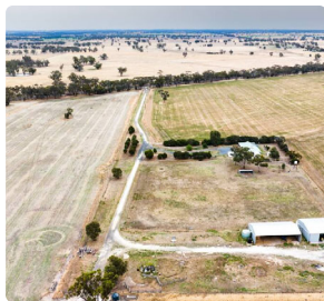
Cropping in prime location