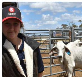
Strong crowds, solid sales as Stock Journal Beef Week wraps up