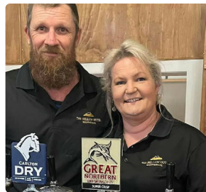
Family proves to be at the heart of The Bellum Hotel