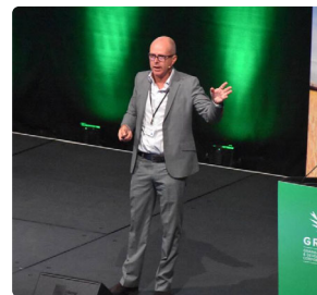
Crucial period ahead for grain prices