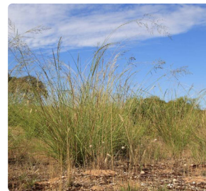
Landholders to fight African lovegrass